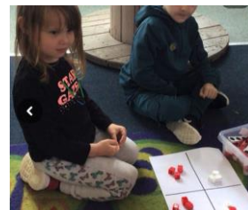
Splitting numbers into quarters.