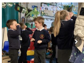
Down in the jungle.