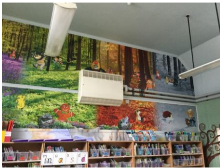
Wonderful new art work in the library - on both sides of the room. It is amazing.

We also have a brand new heating system so should be nice and warm in the winter.