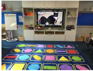
New storage cupboards and new rugs in